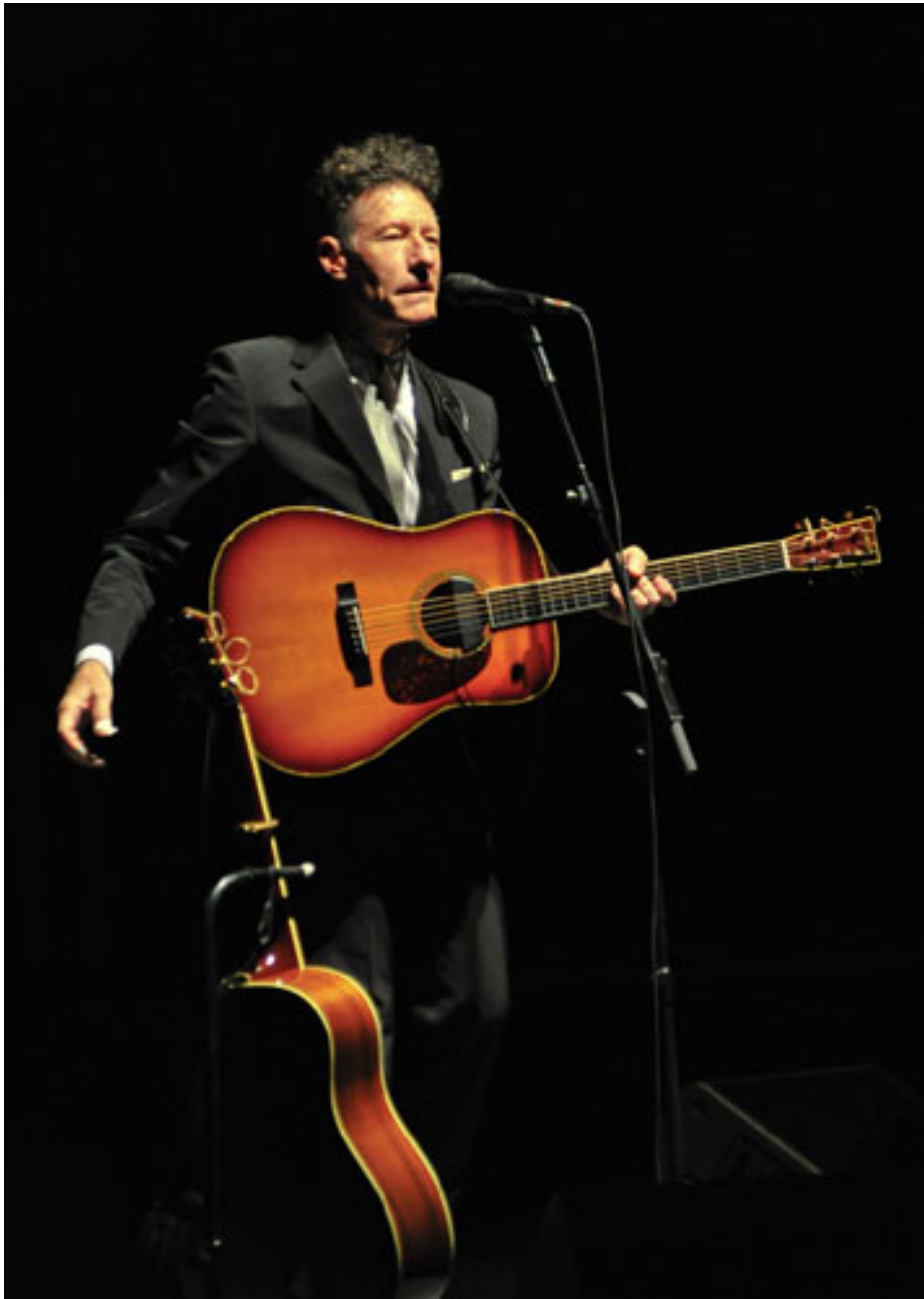
Lyle Lovett, seen here during his Sunday concert at the Tulsa PAC, is starting on a 37-day tour through the United States.

Copyright © 2010, World Publishing Co. All rights reserved