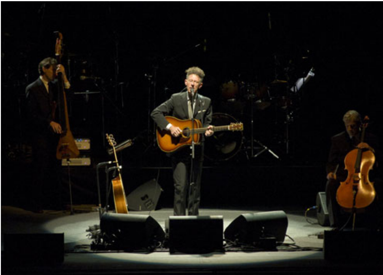
Lyle Lovett and his Large Band perform Sunday at the Tulsa Performing Arts Center.